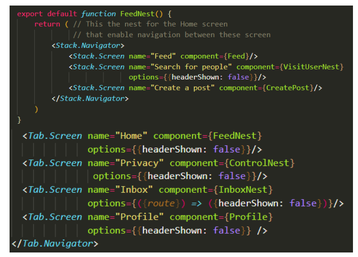
Fig. 4. The upper image is the stack navigator for the home screen with the post feed, and the lower code shows that stack as the first component of the tab navigator, together making a nest.

To make the navigation from the login screen to the main content of the application, a nest enfolding the four nests had to be made. This became a stack navigator within a tab navigator, within a stack navigator where you hide the return arrow when you navigate from the login screen to the main application. The login functionality was made by