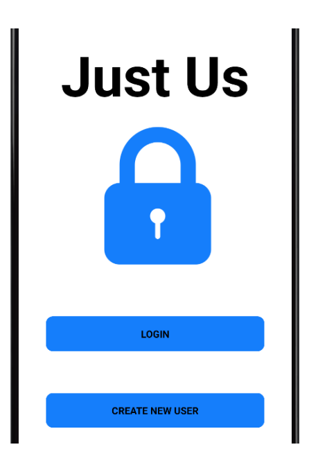
Fig. 3. The first screen of the application

We then made the index screen, which is shown in Fig. 3. This is the first screen the user sees when opening up the application. Nests were used to implement this. A nest is a navigation system within a navigation system. Most of the four tab screens got their own nest which had a stack navigation within the tab navigation, shown in the code of Fig. 4.