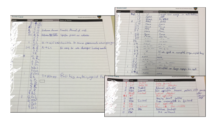
Figure 5: Example score sheets EoP

reflection part after the session, some responded that the need to discuss every card resulted in slow progress; "The purpose of the game is to have fun, but it is too specific" (student response as noted in the observation notes).