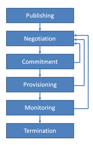
Fig. 2. The SLA lifecycle [1]

We envision an SLA lifecycle as illustrated in Figure 2, which consists of six phases: Providers first publish their SLA templates, and users then initiate negotiation based on these. Once the negotiation is successful, providers and users formally have to commit to the resulting SLA, and the provider effectuates the provisioning. While the service is running, monitoring should ensure that the SLA terms are met, and when the relationship between user and provider comes to an end, the SLA must be terminated. Feedback loops are used when it is necessary to return to the negotiation phase from any of the active phases; e.g., if either of the parties cannot commit to a negotiated SLA, if the provider is unable to provision the service (due to overbooking), or if monitoring reveals that SLA terms are broken. In practice, the contracting period may vary from very short periods like a minute (e.g. the temporary lease of a fiber optic communication channel) to months and years for more stable services (e.g. a backup service for corporate data).