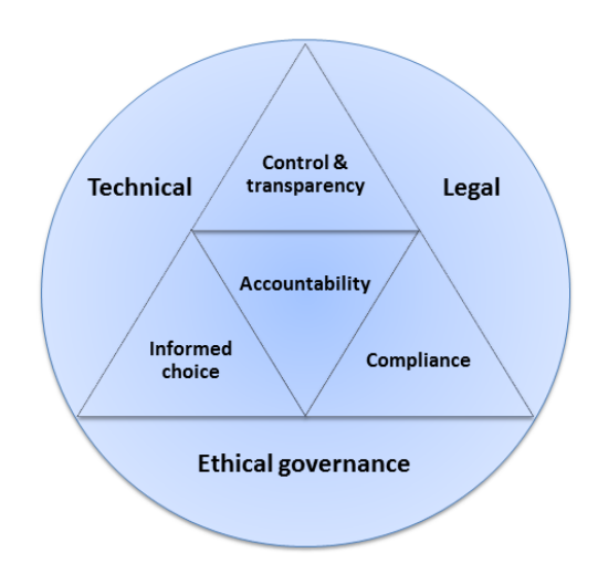
Fig. 2. A4Clouds objectives and their interconnections